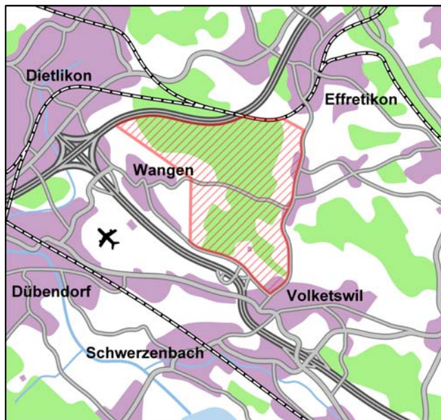
Map 2: Embargoed area Wangenerwald

These embargoes are valid until the day prior the competition. Special rules by the organiser will be valid at the days of competition.