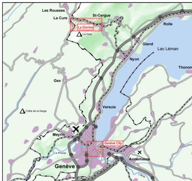
Map 1: Overview

The Event Centre is located in Geneva, max. 10 km from the Airport Geneva.