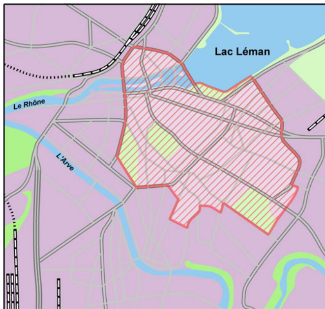
Map 3: Embargoed area Geneva: Vieille Ville